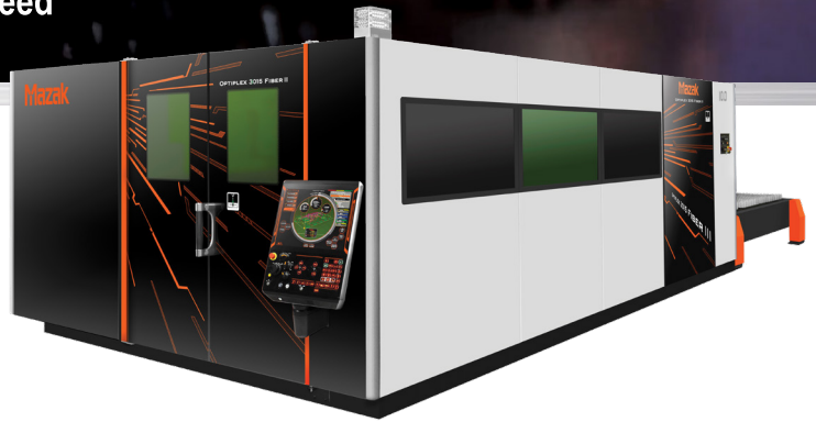
OPTIPLEX 3015 FIBER III

Witness Mazak Optonics high power OPTIPLEX 3015 FIBER III with the new cutting-edge PreviewG Control and our latest edition to our family of top-tier builders, Yaskawa America, Inc, Motoman Robotics Division at Capital's ADVANCES IN PRECISION FABRICATING .